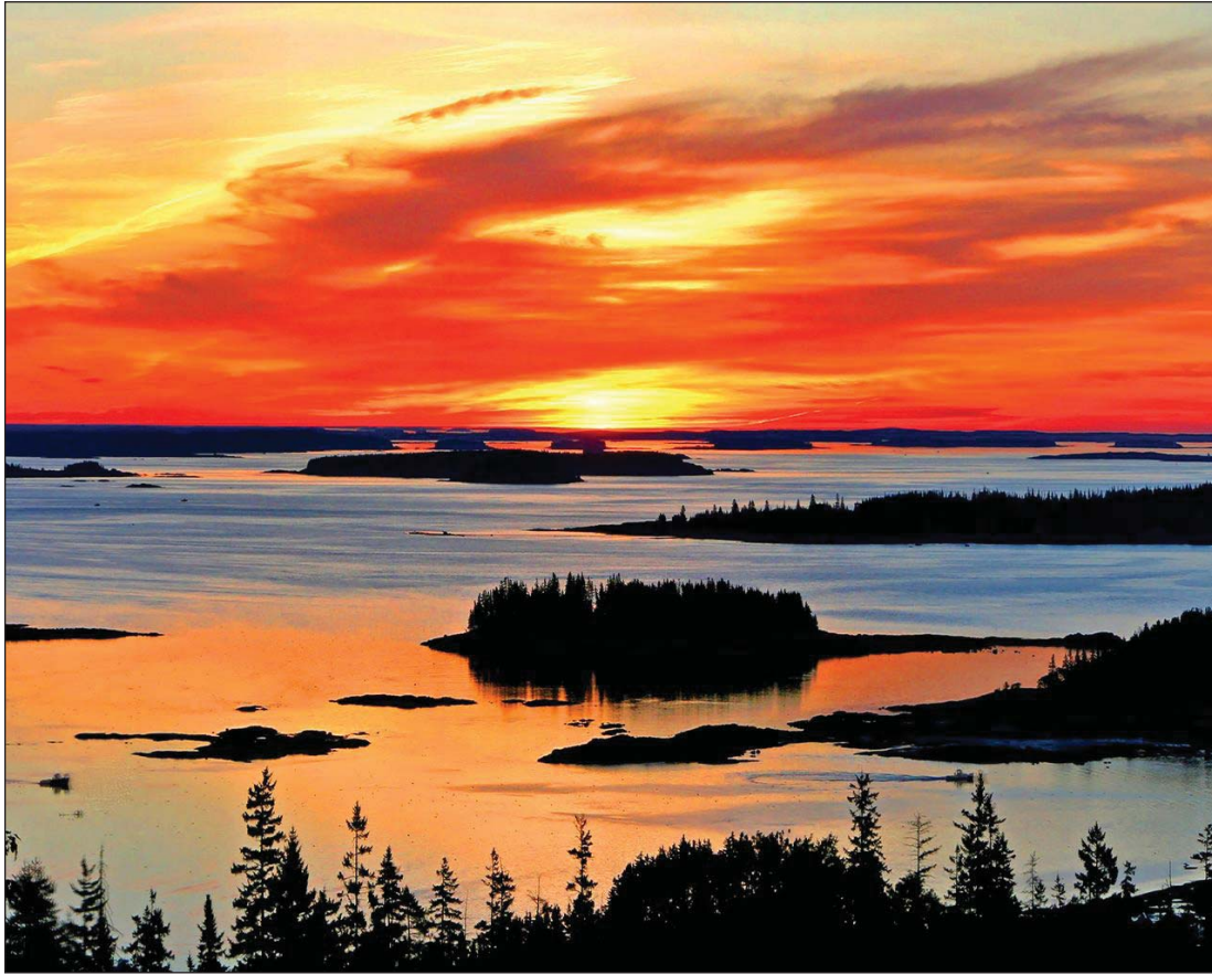
Current Island from the summit of Pigeon Hill.