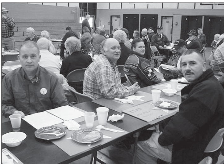
Veterans enjoying breakfast at Rose M. Gaffney Elementary School.

The Rose M. Gaffney and Machias Memorial High School students and staff would like to thank all veterans for their sacrifices for our country.